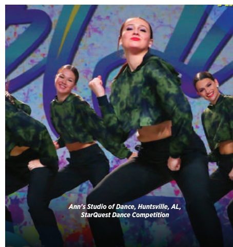
Ann's Studio of Dance, Huntsville, AL, StarQuest Dance Competition