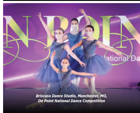
Brisuso Dance Studio, Manchester, MO, On Point National Dance Competition