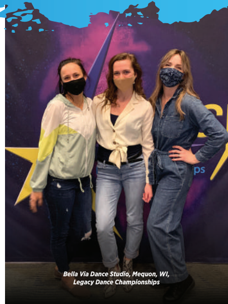
Bella Via Dance Studio, Mequon, WI, Legacy Dance Championships