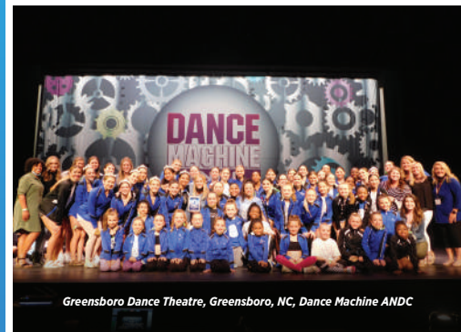
Greensboro Dance Theatre, Greensboro, NC, Dance Machine ANDC