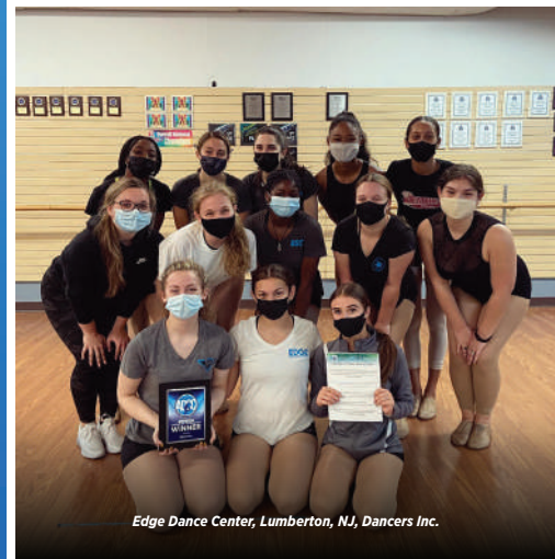
Edge Dance Center, Lumberton, NJ, Dancers Inc.