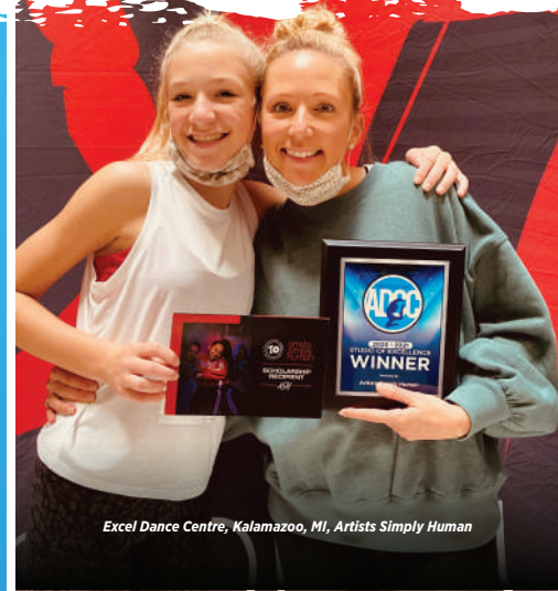
Excel Dance Centre, Kalamazoo, MI, Artists Simply Human